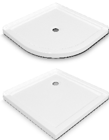
Note: Shower Waste not included.

Englefield's Low-Profile shower trays are made of 2.5mm sanitary grade acrylic and have a 70mm sill height with 40mm upstands for superior water-tightness. They are "quick to fit" as the upstand requires no rebating into the wall framing when using 10mm plaster board.