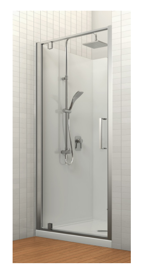
Note: Tapware, accessories and tiles illustrated in photography are not included

The Milano Alcove Shower is available in a range of sizes and wall options. It features 8mm toughened safety glass which is coated on the interior with premium quality ClearShield<sup>®</sup> special glass protector so that it stays cleaner for longer and resists staining. The low profile tray features ultra high 40mm up-stand to enhance watertightness for a drier and safer installation.