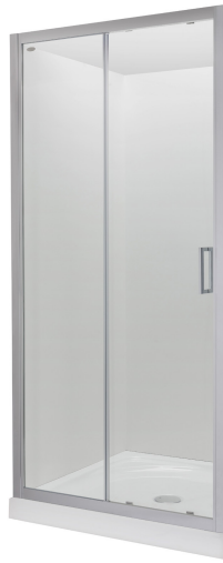
Note: Accessories illustrated in photography are not included

The Studio Glide Alcove Sliding Shower is available in a range of sizes and wall options. It features 6mm toughened safety glass and four sets of dual rollers for a super smooth opening action. The reversible door is designed with quick-release for ease of cleaning. The low profile tray features an ultra high 40mm up-stand to enhance watertightness for a drier and safer installation.